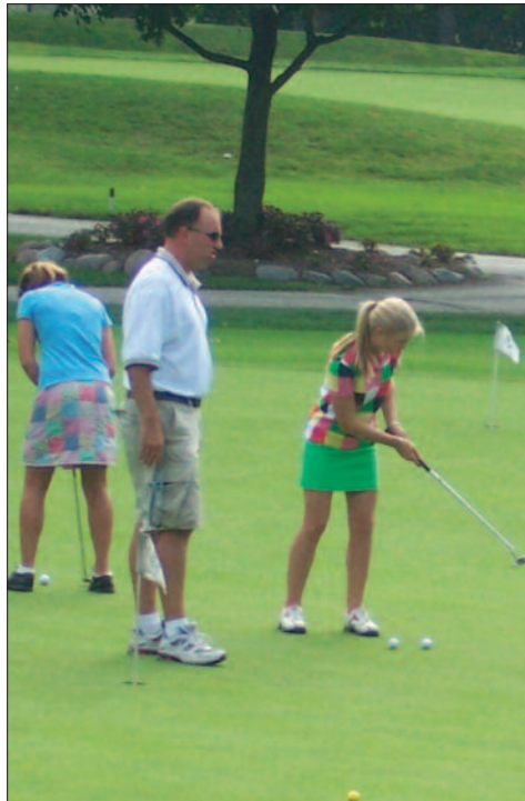
Above: Golfers take some practice shots before the scramble.