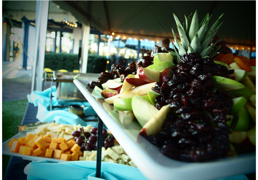
Guest enjoyed delicious food.