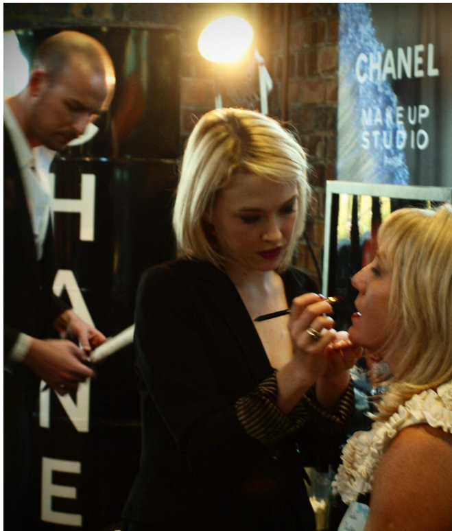
Chanel gave free makeovers.