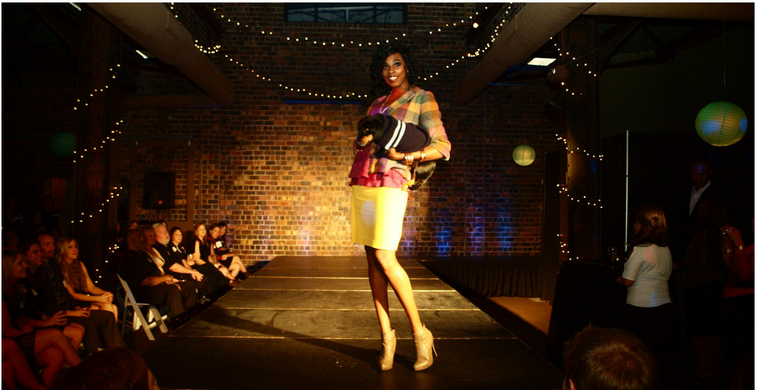
Guests enjoyed a fashion show presented by Elisashley and CAbi.