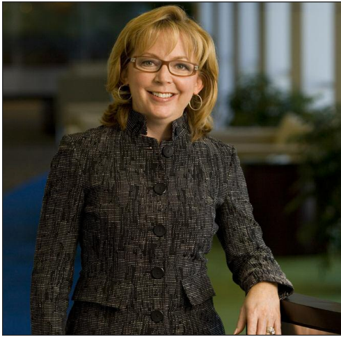
Deborah Platt Majoras

The Ohio Women's Bar Association will honor Deborah Platt Majoras with the prestigious Founders' Award, honoring her achievements and professional excellence in the legal profession.