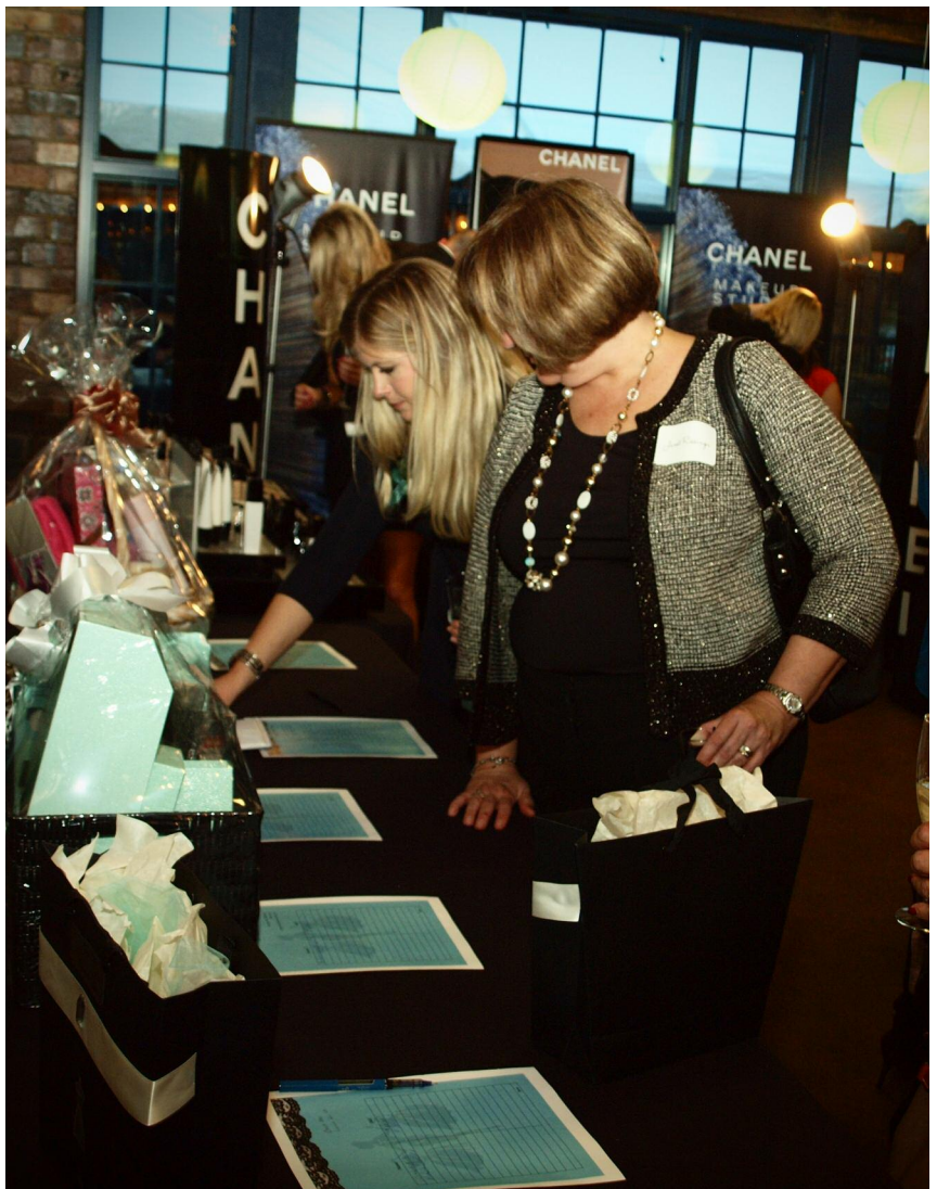
Guests were able to participate in a silent auction that benefited the Ohio Women's Bar Foundation.