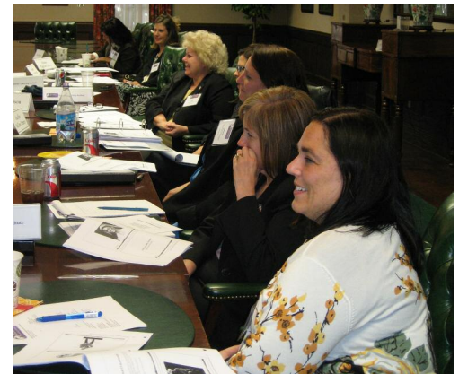
Class members listen to speakers from the Effective Coaching, Branding and Career Strategies session.