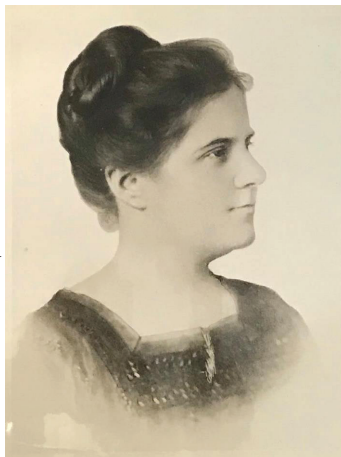
Judge Florence Ellinwood Allen circa 1917

Judge Allen had a remarkable career of firsts. Born in Salt Lake City, Utah, she moved to Ohio to attend Case Western Reserve University. When she graduated, CWRU did not admit women, so she pursued her legal studies at the University of Chicago and NYU School of Law before returning to Cleveland to begin