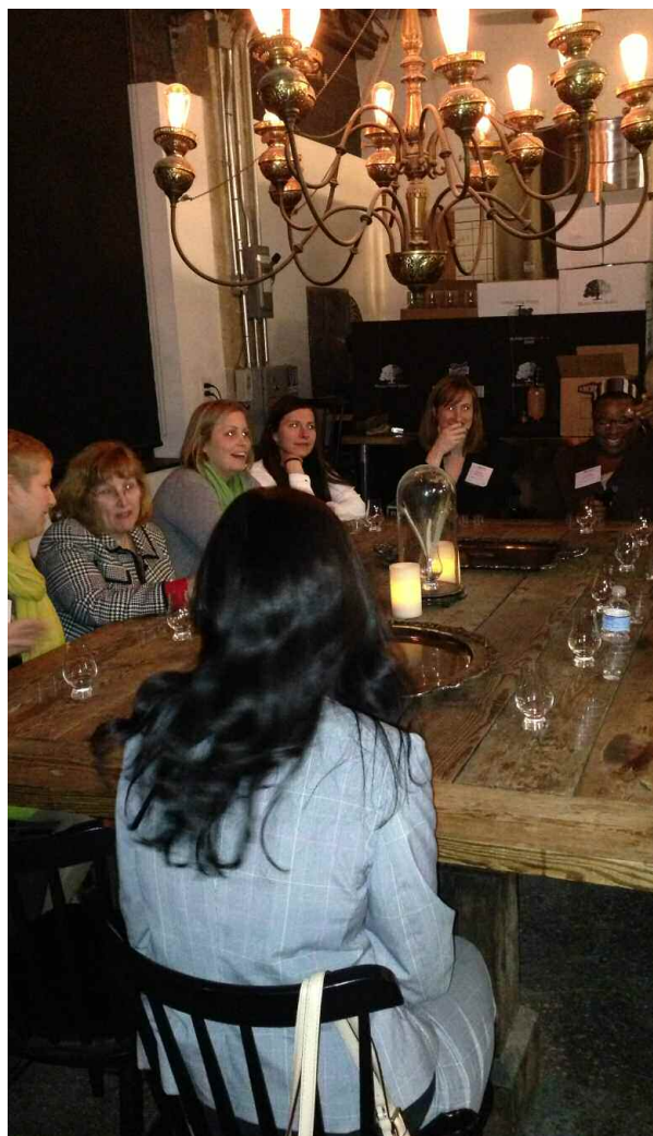
In-house attorneys enjoy the tasting.