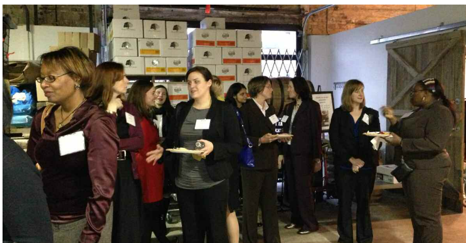
In-house attorneys mingle with one another before the tour and tasting.